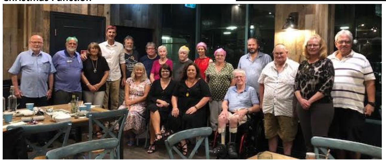
18 members celebrated Christmas and the end of the Camera Club year at the CEX Brasserie. Check out the next page for competition winners of the year ...